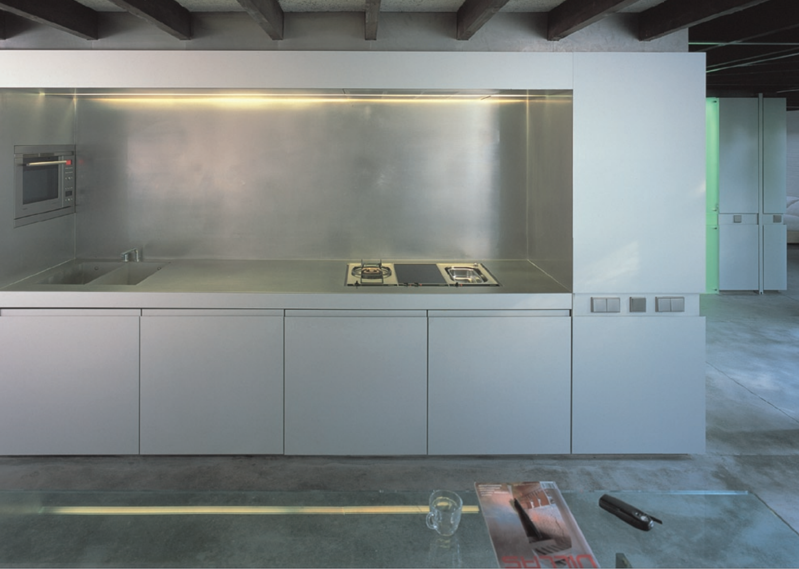
private house Rijkaart · Hoevelaken